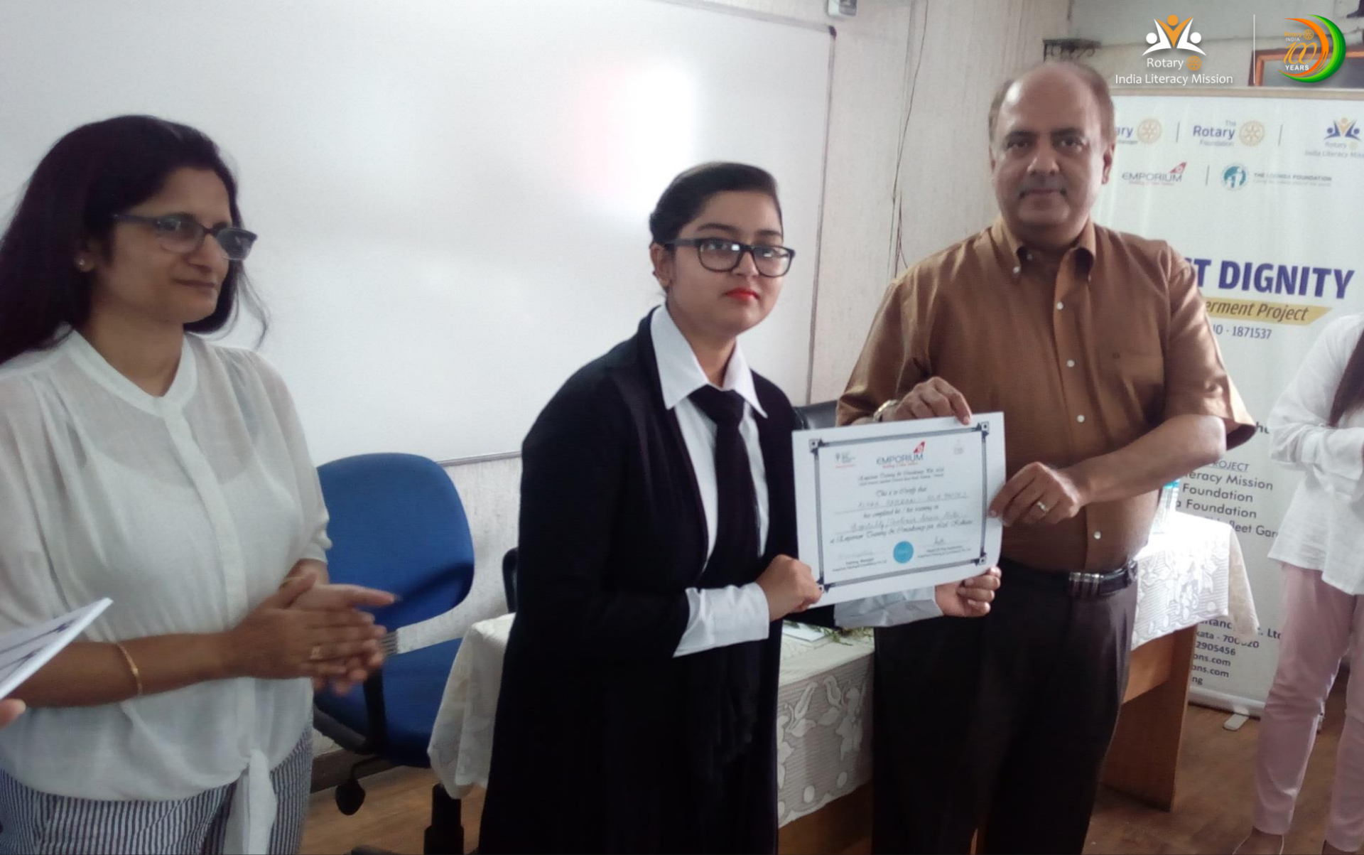
Certificate Distribution Ceremony by Rotary Club Calcutta Mahanagar/RID 3291